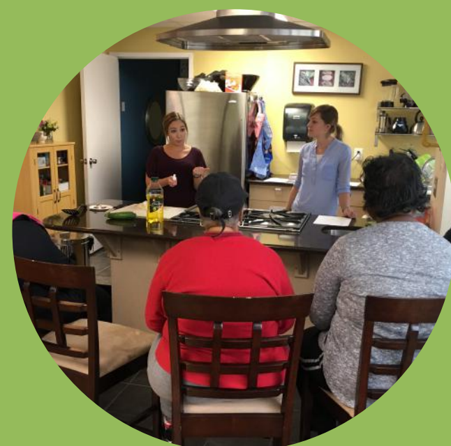
Cooking demonstrations in Joy Wellness Center